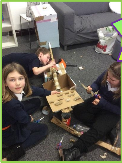
Key Stage 2 Marble run competition