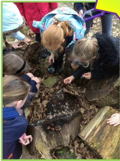
Year 1 and 2 Bug Hunt