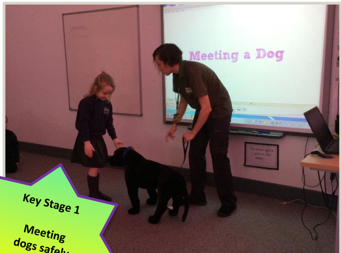
Key Stage 1 Meeting dogs safely