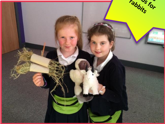
Year 3 and 4 Making kebabs for rabbits