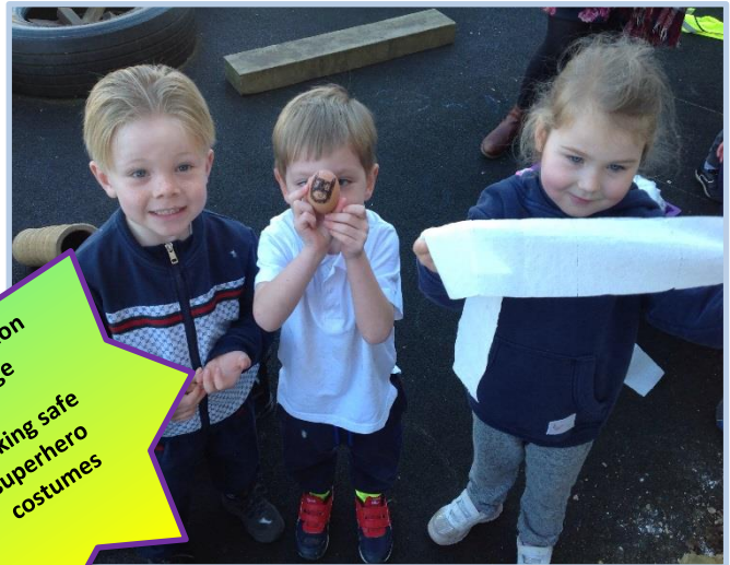
Foundation stage Making safe superhero costumes