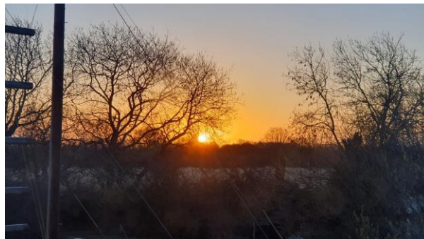
1 - Grafham Friday morning